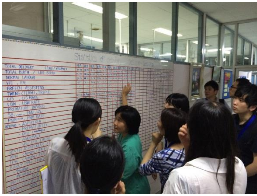
Day 6: Visit to Makarak District Hospital and Local Health Center