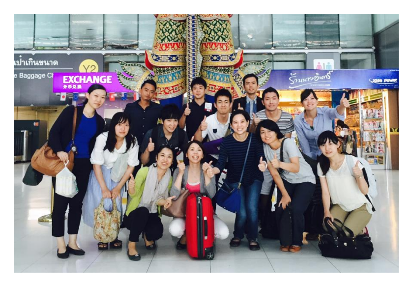
Day 8: From Bangkok to Tokyo