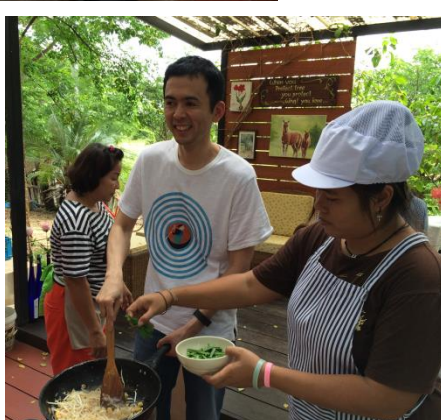
Day 7: Group work followed by cooking with homestay staff