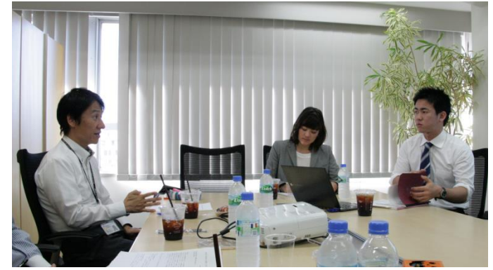
Official Presentation of Policy Memo