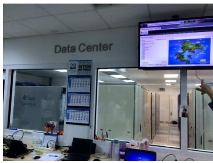
Day 5: Visit to National Health Security Office (NHSO), NHSO Data Center, and NHSO Call Center