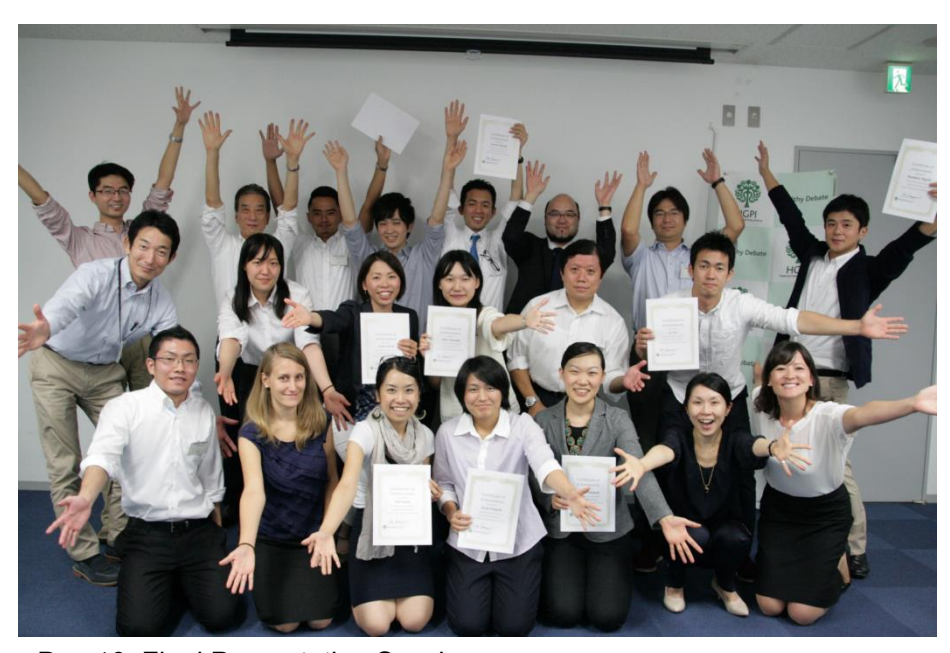
Day 10: Final Presentation Session